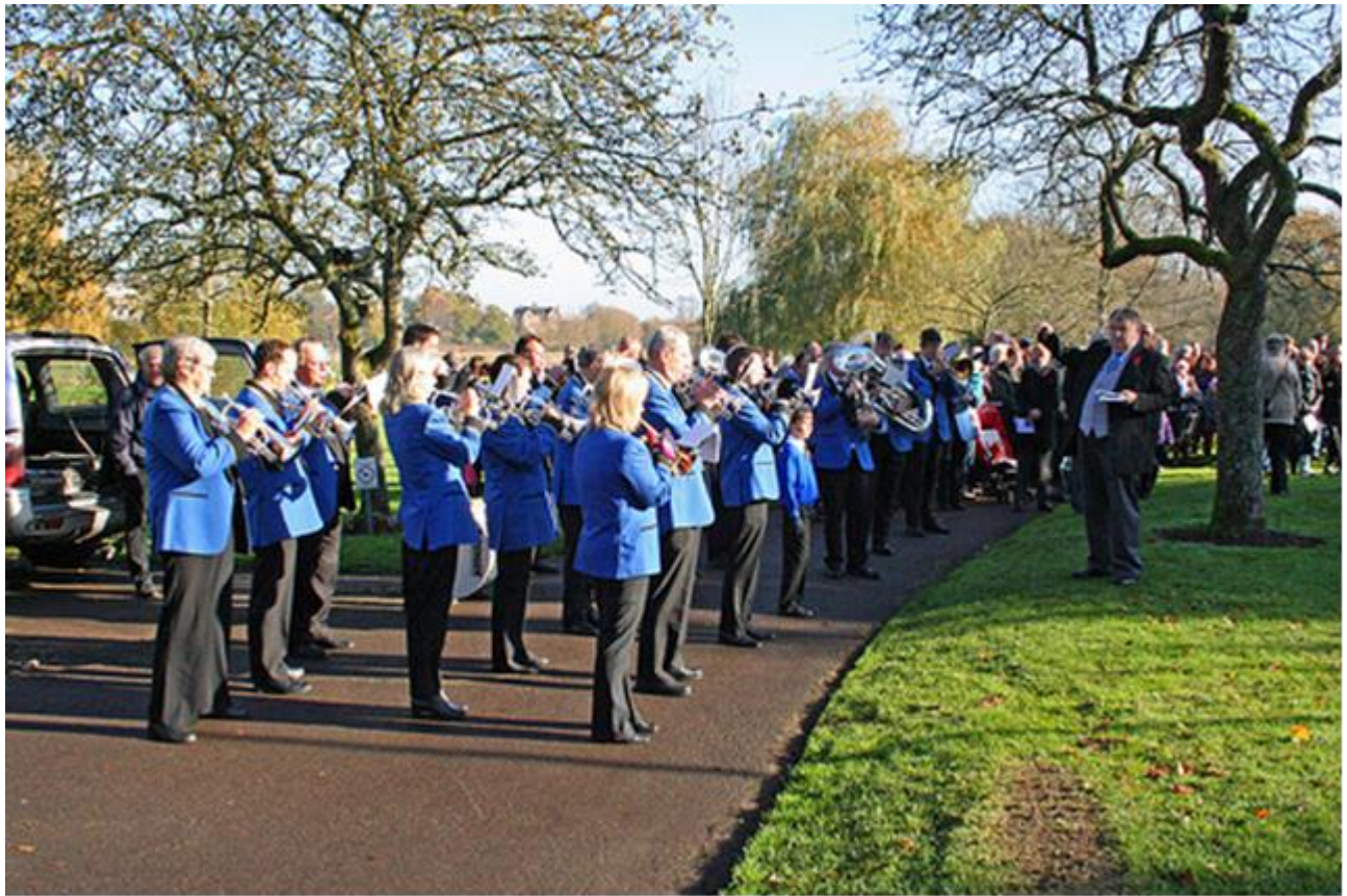
The Band playing at Godalming War Memorial, 11 November, 2012

Remembrance Day fell on Sunday 11 th November this year. The weather was warm and sunny, which bolstered the turnout on the High Street, at the War