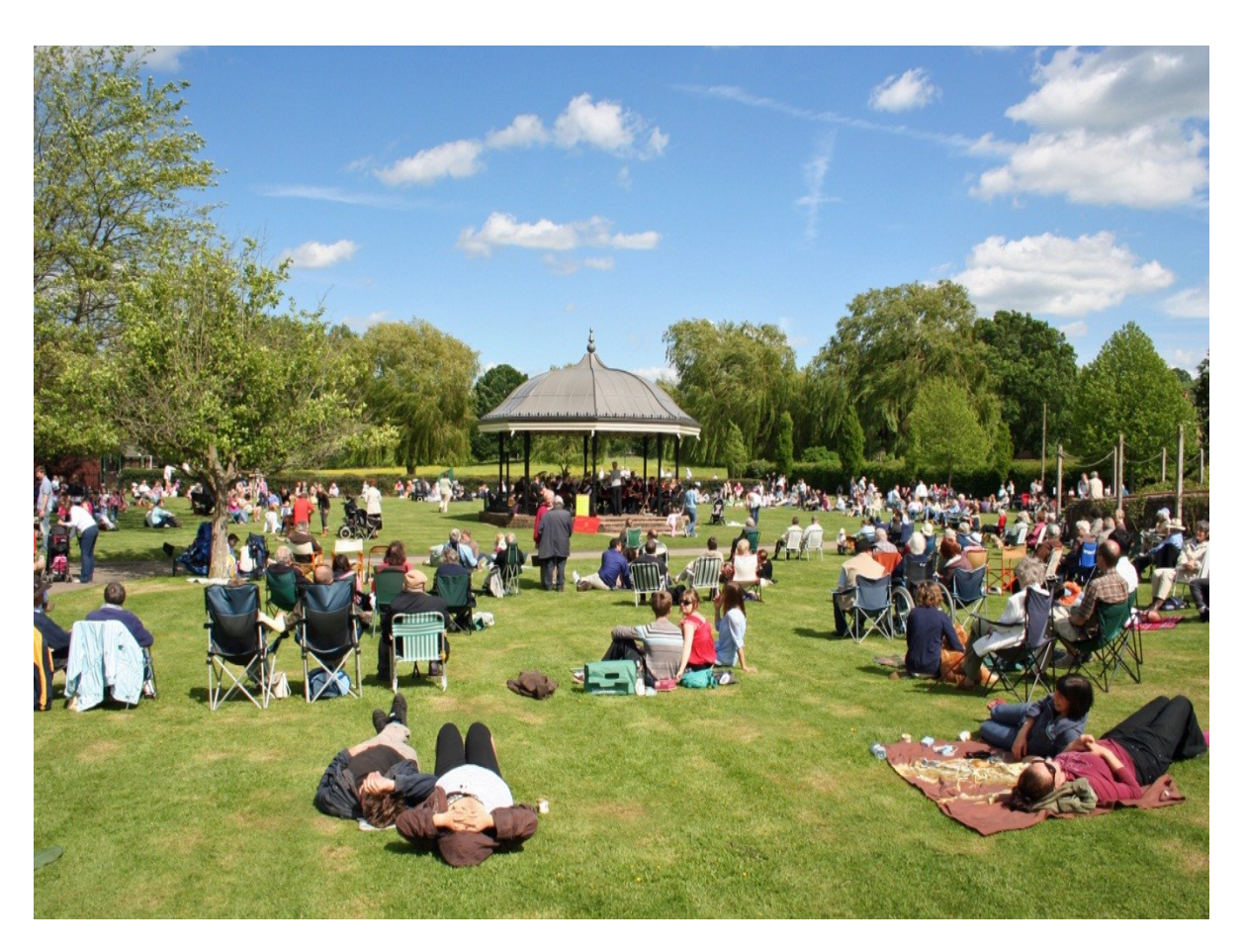
Godalming Bandstand on a balmy Summer's day, 2010